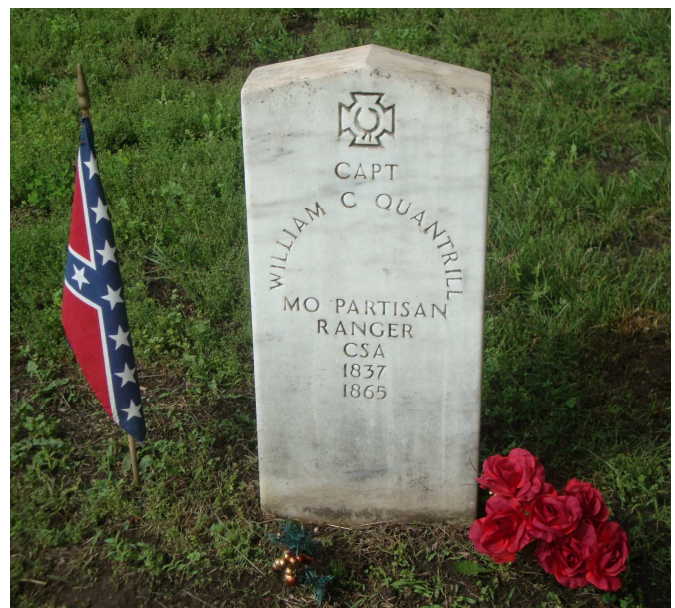
Quantrill's Grave at Higginsville Confederate Veteran Cemetery on Confederate Memorial Day.